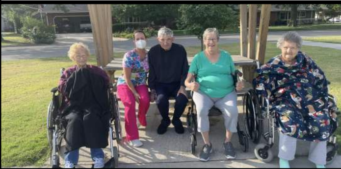
(Above) Though we are experiencing the first cool mornings of spring, our morning walking club has not been detoured from getting out and getting some fresh air and exercise!